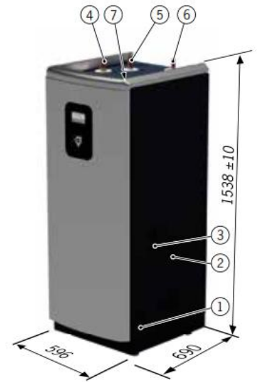
Diplomat Duo Inverter