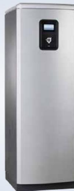
Diplomat Inverter Duo